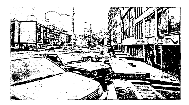
Figure 1: Indiscriminate parking on the footpath and surface making it difficult for pedestrians

Road user behaviour in Bogota is very bad. Red light violation is extremely common. Pedestrians are not regarded, by the drivers, as legitimate road users.