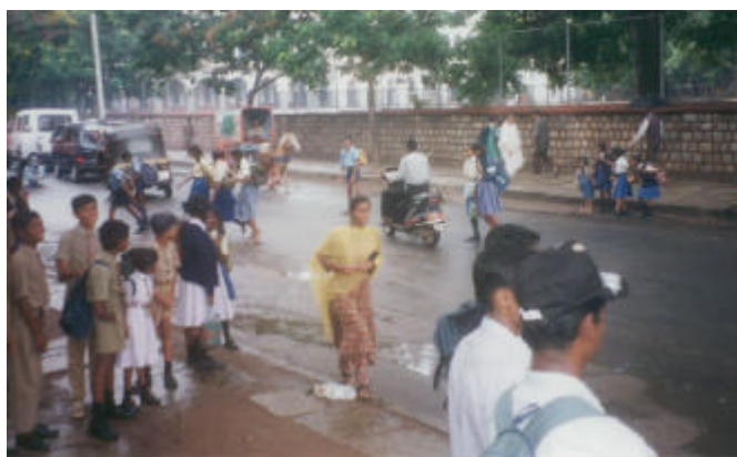
Figure 1: Children crossing a busy road in India

Many children who have been injured as pedestrians require long-term medical treatment and care. This can be a considerable economic burden for the injured child's family. Young pedestrian casualties generally come from the poorer sectors of the community (Christie, 1996; Ghee and Anstrop, 2000). In these sectors, the loss to the family is twofold: firstly the cost of caring for the injured child and secondly the loss of the income that the child earns or will earn. This loss of income means that the injury or death of a child can bring a poor family lasting financial hardship as well as personal grief.