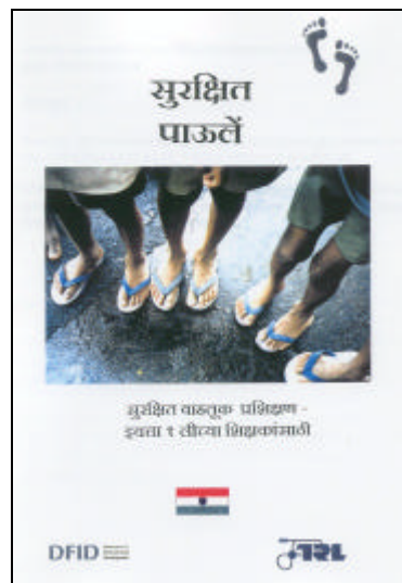
Figure 4: Cover of the 'Safe Feet' Resource (Marathi Version)

It was designed to follow the elements of the existing competency based curriculum and 'joyful learning' approach to teaching that was recommended in The National Policy on Education published in India in 1986. The resource was designed to increase the children's observational skills and their knowledge and understanding of traffic. It ensured that they could recognise the dangers of traffic, behave safely as pedestrians and know what they needed to do to keep themselves and others safe.